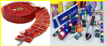
Fire crackers & Flares