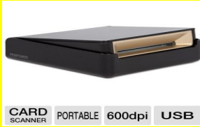
Credit Card Scanner