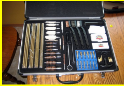
Gun Cleaning Kits

NCB North Tower 2 Oxford Rd., Kingston 5 website: www.mns.gov.jm email: information@mns.gov.jm telephone: 1(876) 906-4908;906-4080