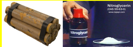
Dynamite & Nitro-glycerine