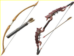
Bows & Arrows