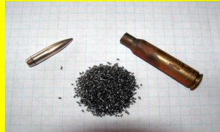
Gun powder and cartridge